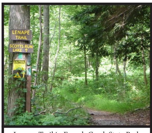
Lenape Trail in French Creek State Park

Linear parks are very popular throughout the nation as less and less open space remains within developing areas. The Region has an abundance of existing and planned linear parks. The Horseshoe Trail weaves about 16.7 miles in an east-west direction across Robeson and Union townships. French Creek State Park lists some 40 miles of trails that blanket their park. The Thun Trail generally follows an abandoned railroad right-of-way along the Schuylkill River just south of the Region's northern boundary for about 10 miles through Robeson, Birdsboro, and Union. In all, the Region has some 78 miles of existing linear park trails. The NRPA does not apply park size and service area standards to linear parks, recognizing their highly-diverse character and the often "opportunistic" ways that they are acquired.